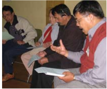
REDI coalition meeting on the General Plan.

I am an APEN leader and have worked with APEN and the Chinatown coalition on the Lake Merritt Development plan for last two years. I helped to collect surveys, and attended numerous workshops and other activities, to express our thoughts on how to make this area plan better and make Oakland become one of the most successful Transit-Oriented Development (TOD) cities.