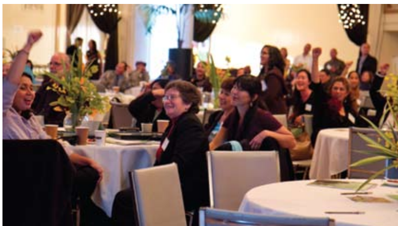
Community members, supporters, and allies celebrate 18 years of APEN.

To recognize APEN's growing civic engagement work, our theme was "going to the polls in style."