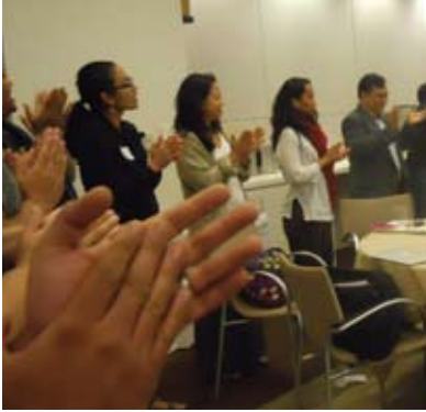
The APIs and Climate Change Conference in LA.

communities of color. In 2010, the bill reached Schwarzenegger's desk but was vetoed. This year, the bill was reintroduced on the senate side as SB535 and is now a 2-year bill. APEN staff is proud to provide leadership in moving the bill and organizing support with our APACC allies.