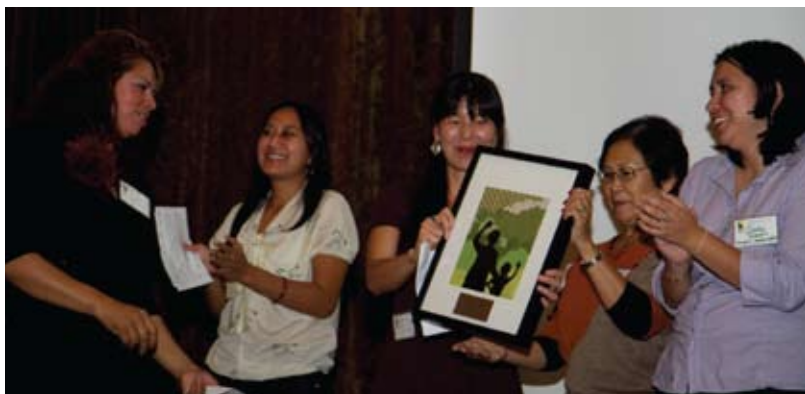
Honoring members of the National Domestic Workers Alliance and California Domestic Workers Coalition.

our current problems and the breadth of our communities' hopes and dreams. Our visions must tap into the deepest place of hope and commitment so that we can truly match what we're up against. APEN has that ambition, to change the world for people and the planet. APEN has big dreams.