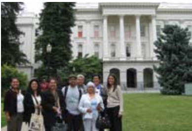
Members of the CEJA SB 535 team at the state capitol.

As part of our growing statewide work, APEN led the California Environmental Justice Alliance's (CEJA) work on SB 535, the Healthy Neighborhoods Fund (formerly AB 1405). SB 535, of which CEJA is a co-sponsor, would direct funding toward a Community Benefits Fund for projects related to carbon reduction and mitigation of climate change impacts in the most vulnerable communities – low-income