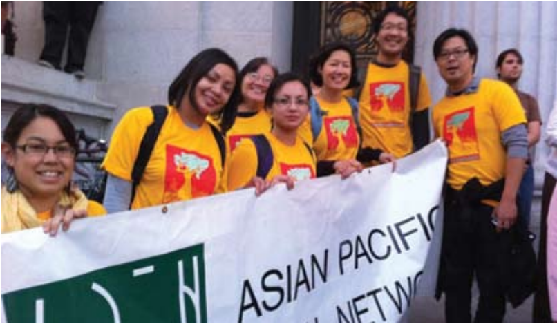
APEN staff mobilizes to support the Oakland encampment.

justice and economic inequality, and turned out to many Occupy events and marches.