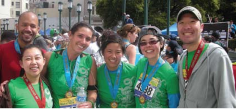
Team APEN runners at the Oakland Running Festival.

power if those mechanisms are not included next time we meet.